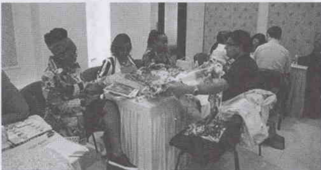
African Delegates from Ethiopia, Kenya, Uganda & Rwanda at the B2B Meetings