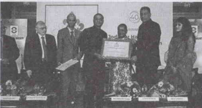
Best Digital Adoption By An Industry Association - Jodhpur Handicrafts Exporters