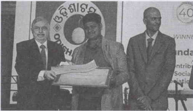
Outstanding Contribution to Industry Growth & Social Impact By An Association - Bhagamunda TRCS Ltd.