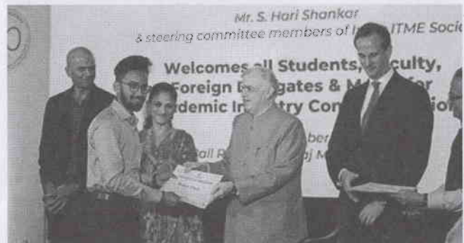
A student receiving certificate at the hands of Justice Shri. P. Sathasivam, Former Chief Justice of India & Former Governor of Kerala