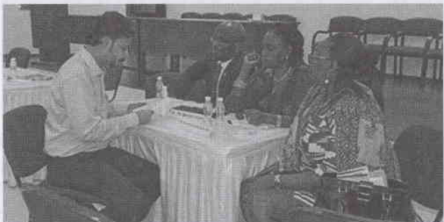
African Delegates from Ethiopia, Kenya, Uganda & Rwanda at the B2B Meetings