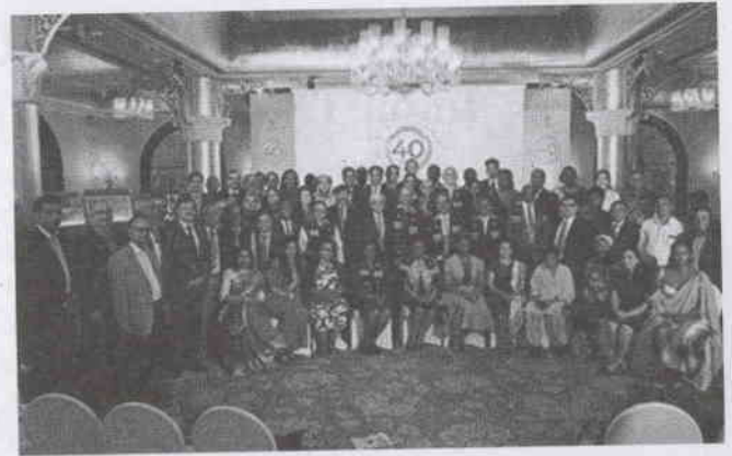
A memorable picture of Speakers & Guests during the 40th Year celebration for India ITME Society